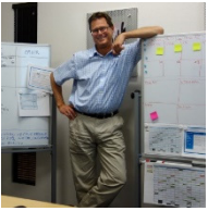
LIAB Lundberg Innovation AB